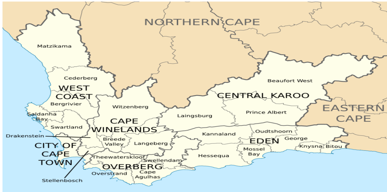
Fig. 2 District municipalities in the Western Cape Province 702

The Western Cape Province is situated in the south-western part of the country. 703 It is the fourth largest of the nine provinces in both area and population, with an area of 129,449 square kilometers and a population of 5.8 million. 704 The Western Cape Province resembles an L-shaped which extends north and east from the Cape of Good Hope. 705 The far interior of the Western Cape Province forms part of the dry Karoo and the south coast boasts the lush and evergreen vegetation extending to Table Mountain. 706 The Cape of Good Hope is most popularly known in Western